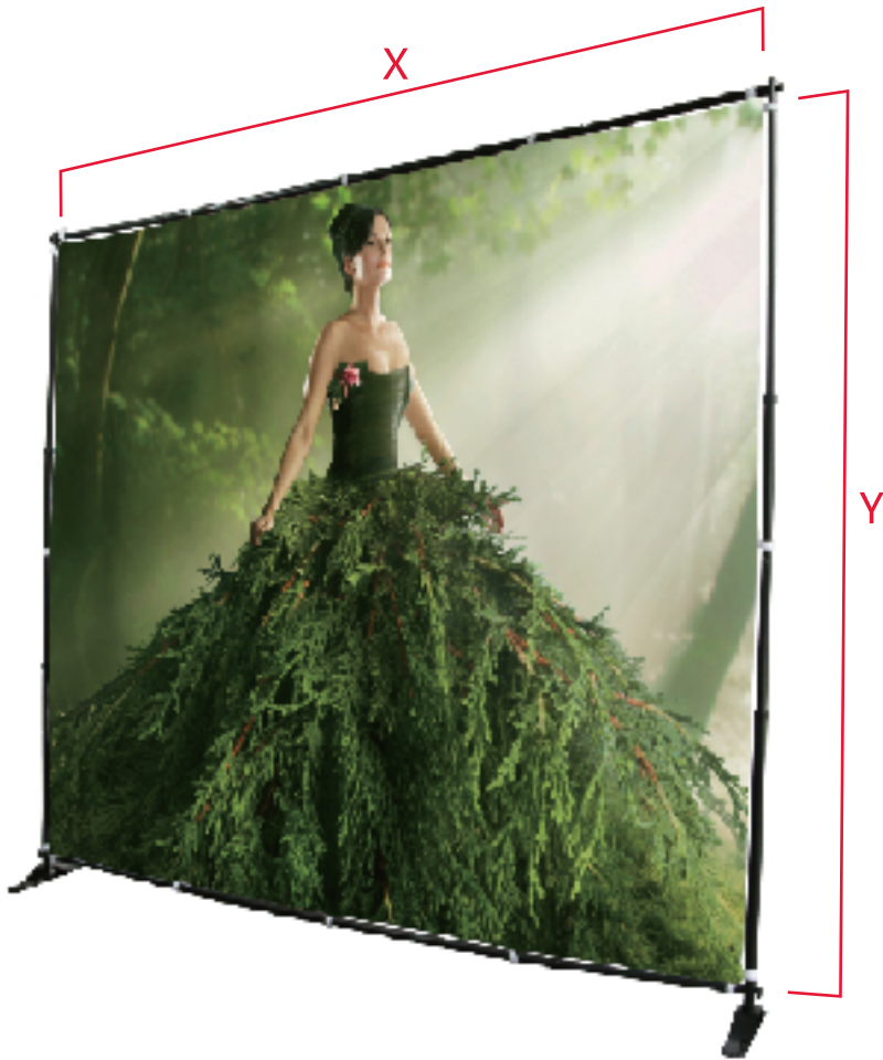
Option 1: Velcro Type