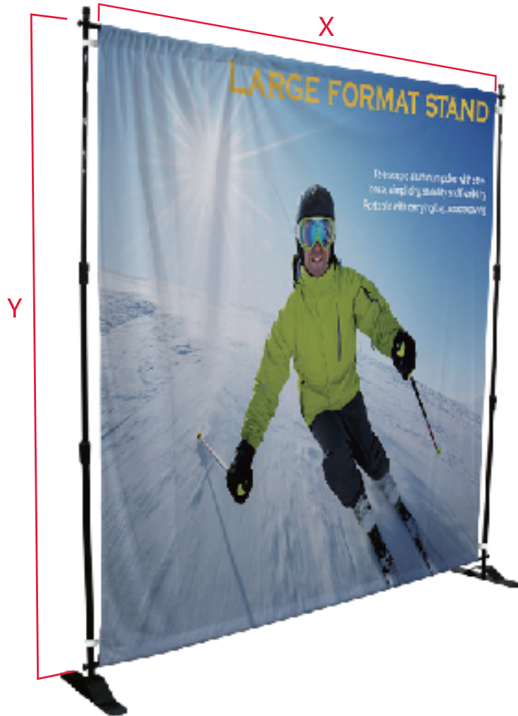
Option 2: Sleeve Type